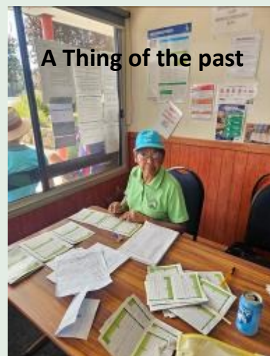
A Thing of the past